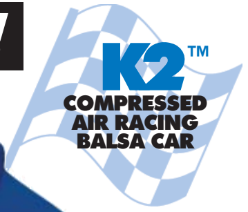
K2™ COMPRESSED AIR RACING BALSA CAR