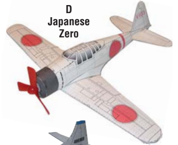
D Japanese Zero