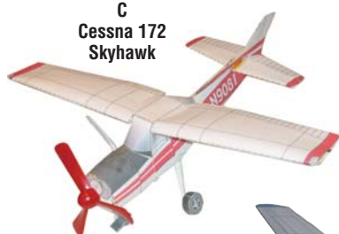
C Cessna 172 Skyhawk