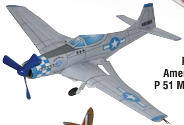
F American P 51 Mustang