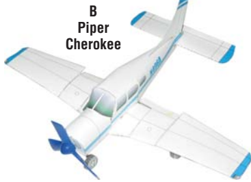
B Piper Cherokee