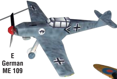
E German ME 109