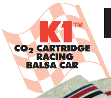
K1™ CO 2 CARTRIDGE RACING BALSA CAR