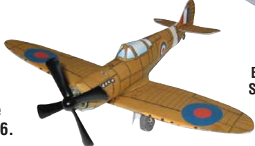
G British Spitfire

Planes work with the PowerPole™ on Page 46.