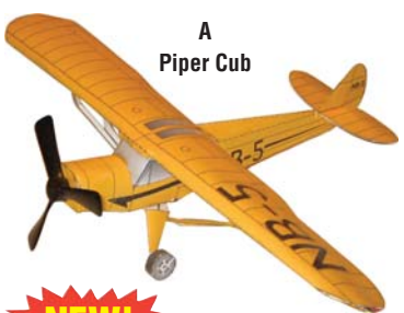
A Piper Cub

K2™ No CO 2 Racing Car Blank 391248 Pre-Drilled Hole .....$6.75 or $5.95 ea./10+ 391246 Blank w/out Hole.....$5.75 or $5.45 ea./10+